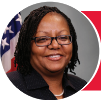
Robin Evans Deputy Commissioner for Patents United States Patent & Trademark Office